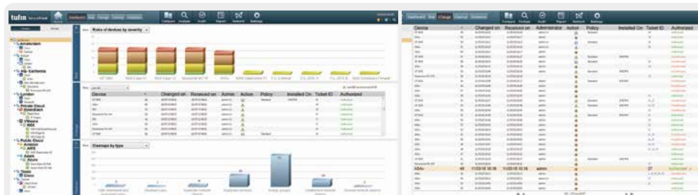
Main dashboard and detailed view

SecureTrack's real-time visibility into all firewall and security changes across the enterprise provides clear insights into network connectivity and policy changes, with alerts for potential new security risks. With this real-time visibility, trouble-shooting of issues is simple and quick. SecureTrack provides firewall administrators and security teams with the tools required to rapidly understand and manage network security.