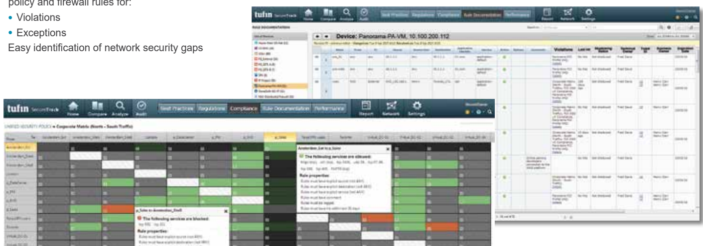
Security Zone Matrix dashboard and detailed rule documentation view

Tufin Orchestration Suite's SecureTrack provides powerful firewall and security policy management